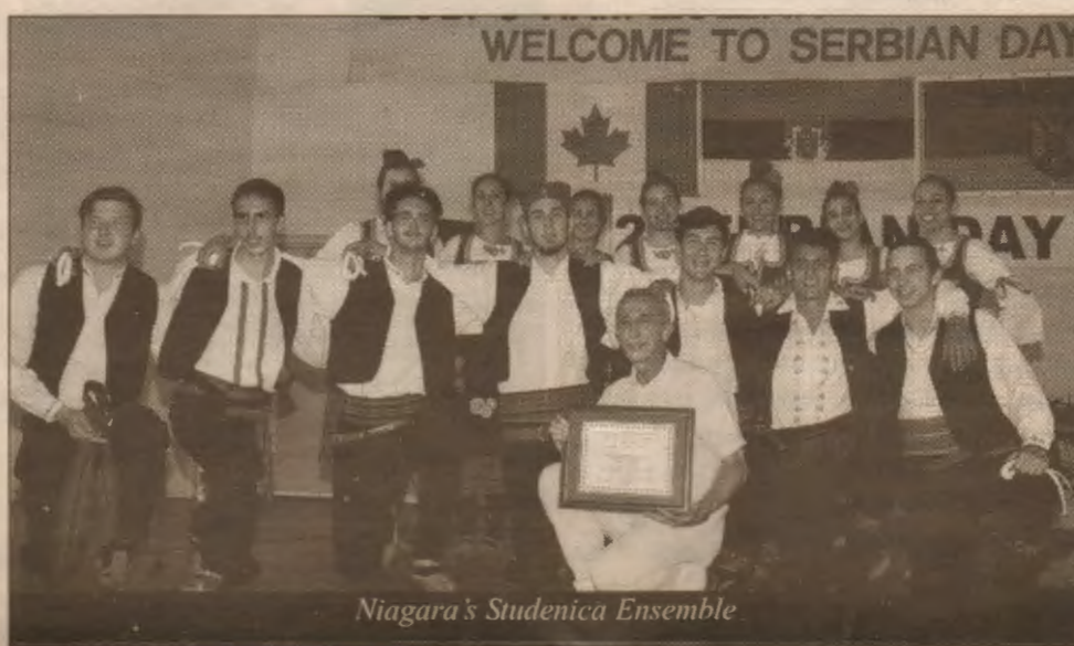
Niagara's Studenica Ensemble