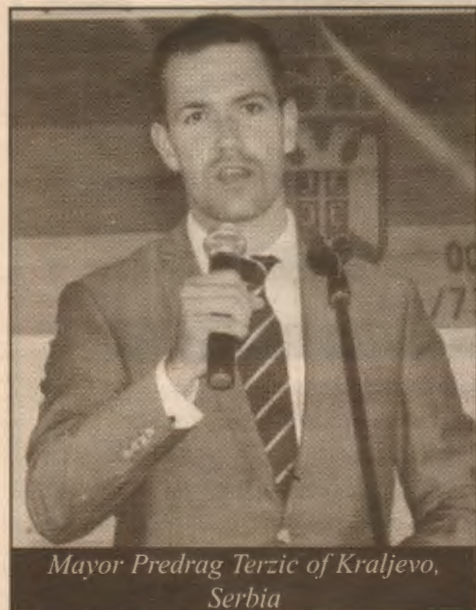
Mayor Predrag Terzic of Kraljevo, Serbia

In December 2016 a fire in the small Serbian hall on the grounds of the St. George Church completely destroyed the interior leaving the community without a gathering place for events and posing a problem for Serbian Day food preparations. But, as they say, necessity is the mother of invention and the resourceful Niagara community had to find ways to tackle these challenges. The first question at hand was whether to mark Serbian Day at all this year. An extraordinary meeting of the Church and the Odbrana decided that it was vital to uphold the tradition without interruption, even if it meant having to do some things differently. In other words, the commitment to the 72-year tradition was strong. Plans were put into place to rent a large tent and prepare the barbequed and grilled food – lamb, pork, chevaps, fries – salad and coffee, while the lenten lunch and dinner were prepared by a restaurant. It worked perfectly.