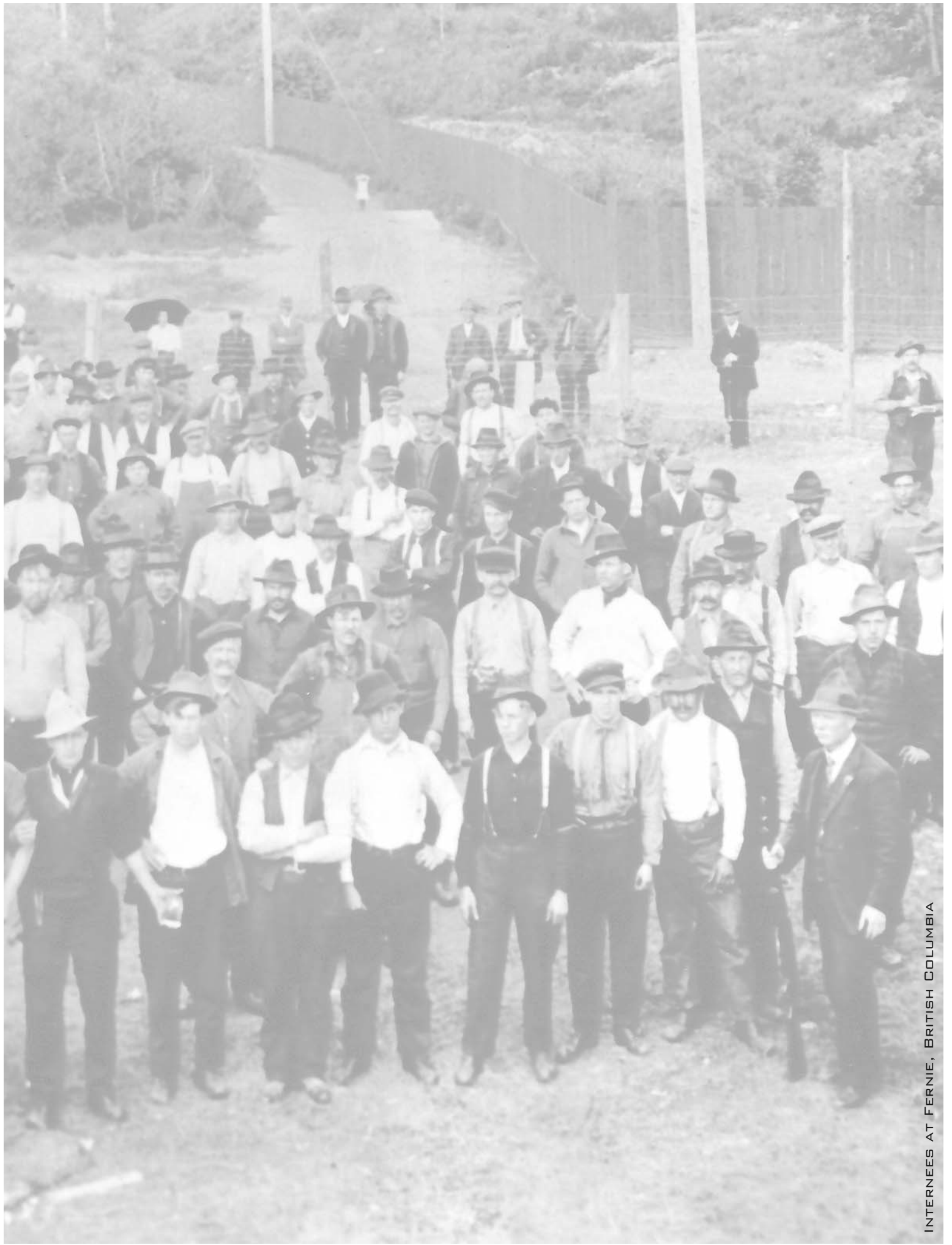
INTERNEES AT FERNIE, BRITISH COLUMBIA