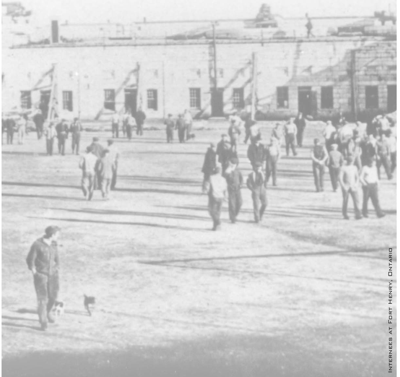
INTERNEES AT FORT HENRY, ONTARIO